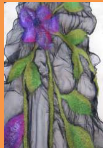
My violet scarf was featured on the cover of the Journal of the International Feltmakers Association. Lovely surprise!