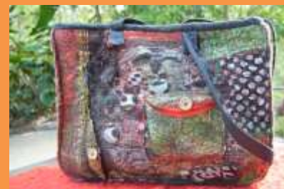
Some bags from my exhibition