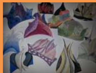
Playing with hat designs on holidays