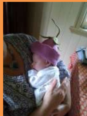
My new great neice with her new felt hat!