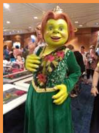
How hilarious... Princess Fiona in my felt...can only happen on a cruise!! Not sure whether to be proud or embarrassed!